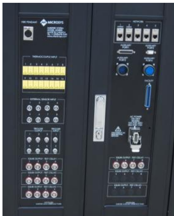
Rear Panel of SureFire System showing connections

SureFire is a fully automated system for testing airbags, inflators, instrument panels, seats, pretensioners and other pyrotechnic devices